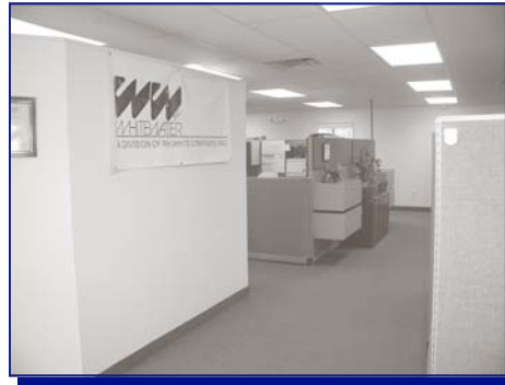
New main office in Charlton, MA

2006-2007 was a transition year for WhiteWater, Inc. The company completed its move to newly leased space in Charlton, MA. An internal transition committee was formed who were tasked with planning and coordinating the move while other staff members performed the actual move. With the assistance of our parent company, R.H. White Companies, who helped with IT support and renovations to the new facility, the move went as seamlessly as possible. An open house is planned for all to come and visit our new home.