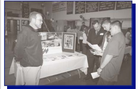
Southbridge students learn about opportunities in water and wastewater

This was a successful event for both the students and WhiteWater. Not only were we able to step up and help out the community, we also had the chance to educate potential future employees and network with others in the local business community.