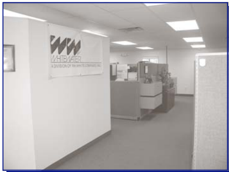
New main office in Charlton, MA

2006-2007 was a transition year for WhiteWater, Inc. The company completed its move to newly leased space in Charlton, MA. An internal transition committee was formed who were tasked with planning and coordinating the move while other staff members performed the actual move. With the assistance of our parent company, R.H. White Companies, who helped with IT support and renovations to the new facility, the move went as seamlessly as possible. An open house is planned for all to come and visit our new home.