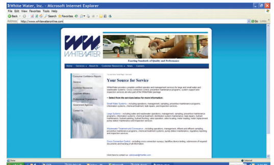
WhiteWater's website features a sophisticated new look.

an About Us section which gives an overview of our company, and a page dedicated to career opportunities for potential employees. Community water systems can access each system's Consumer Confidence Report, which can also